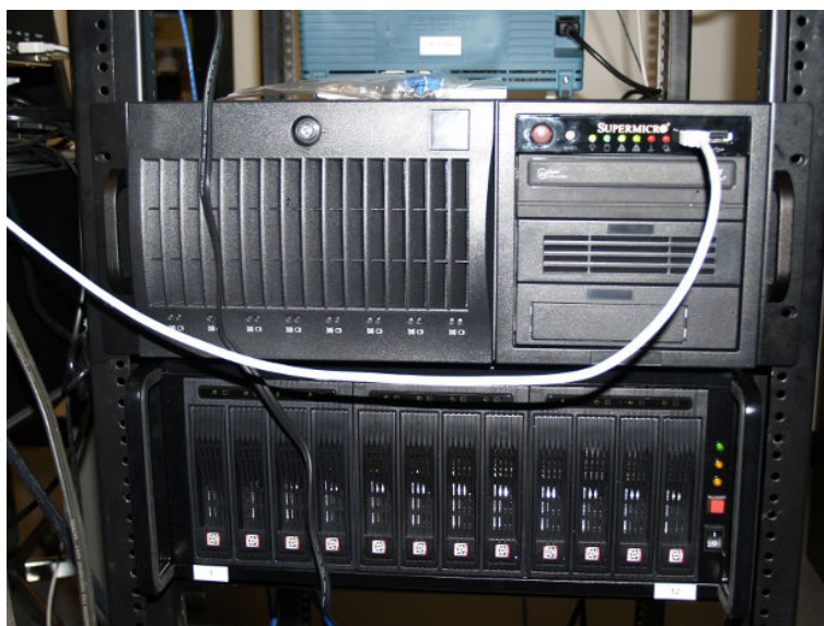
Figure 2. The storage system for the CoMP-S tested at the National Center for Atmospheric Research, Boulder, USA.