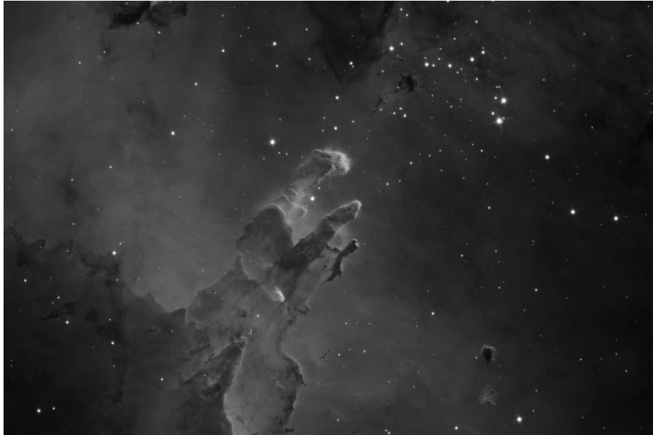
Figure 3. M16 – Pillars of Creation in Ha filter. Stack of 15 images with 5 min exposure.