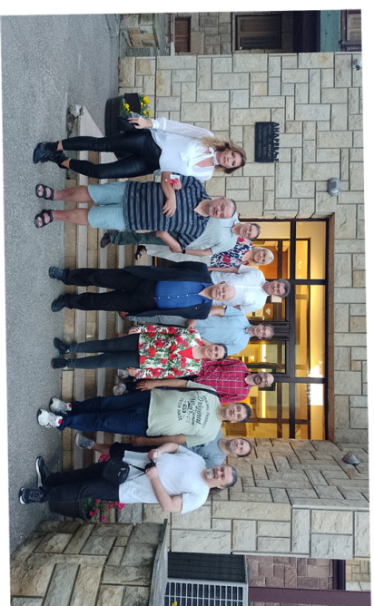
The photo collage: IV Meeting on Astrophysical Spectroscopy: A&M DATA - Atmosphere