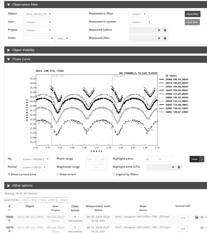
Figure 2. An example of the dataset for a star in the AMPER database.