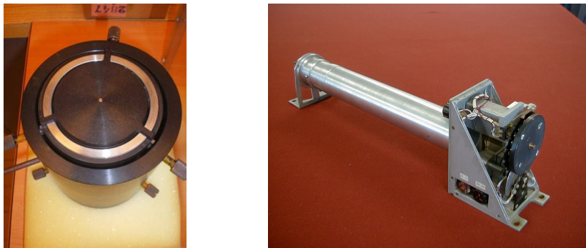
Figure 2. First space experiment with Czech grazing incidence X-ray optics was the X-ray telescope with photographic recording developed in collaboration with Poland and Soviet Union for the Vertikal 8 rocket flight in 1979. Left: The X-ray mirror. Right: The telescope.

The most recent Czech X-ray mirror in space is then the 1D LE module on the VZLUSAT-1 cube satellite (Pína et al., 2016; Urban et al., 2017a). Further experiments are planned in the near future, for example the sounding Water Recovery X-ray Rocket (Dániel et al., 2017; Stehlikova et al., 2017a) with iridium coated X-ray mirrors (Stehlikova et al., 2017b).