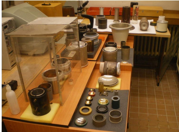
Figure 4. The X-ray optics laboratory at the Ondrejov Observatory of the Astronomical Institute of the Czech Academy of Sciences, demonstrating the various technology tests.

It should be noted that the development before 1987 was done completely independent, without any contact to other groups abroad and without access to relevant literature and/or meetings and workshops. The development of galvanoplastic replication was also completely independent on efforts abroad.