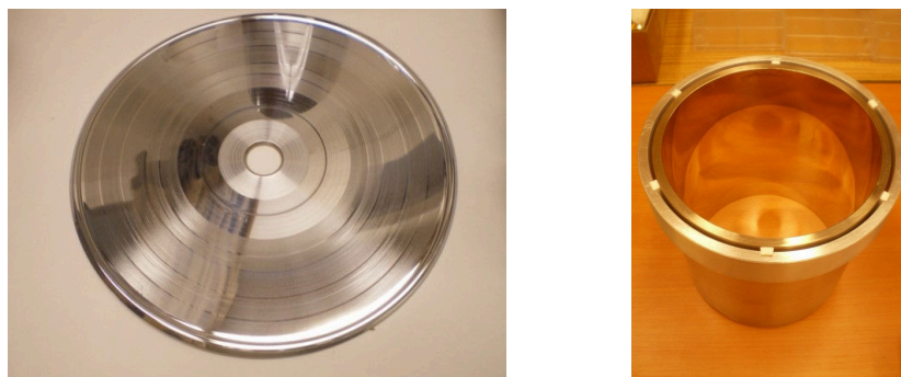
Figure 1. The early stages of the Czech X-ray optics developments. Left: Electroformed mandrel for musical records. Right: Replicated galvanoplastic Wolter 1 mirror with an aperture of 115 mm developed for the AUOS-S satellite. The mirror material was quite heavy, made from nickel with a wall thickness of around 1 cm

The first Czech X-ray mirror in space was the Wolter 1 mirror (50 mm aperture) on the Vertikal 8 rocket (Hudec et al., 1984), as illustrated by Fig. 2. In this historical experiment, soft X-ray images of the sun were obtained in an experimental trial of the f/45 RTF imaging telescope (using a 6 micron-thick Al filter for 0.8-2.2 nm wavelengths and a 20 micron thick Be filter for 0.6-2.0 nm) during the Vertikal-8 high-altitude rocket flight of September 26, 1979, with the data being analyzed using digital processing techniques. The two images are found to be underexposed, so that only one active region, corresponding in position to McMath 16298, could be defined. The method of filter ratios was used to calculate the temperature and emission measure of the region as (1.3 \pm 0.5) \cdot 10^6 K and 4 \cdot 10^{29} \text{ cm}^{-3} , respectively. This experiment was repeated in 1980 with Vertikal 11 rocket flight. There were always two X-ray telescopes