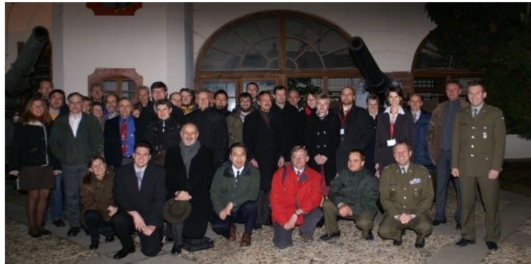
Figure 7. Participants of the 1st AXRO workshop held in Prague, December 2008.

as documented by Fig. 6. At the workshop, we have decided to repeat it with opening it to the international astronomical X–ray optics community. The first AXRO workshop was then indeed organized in Prague, at the historical Vila Lanna, in December 2009, see figure 7, and since then the astronomical X–ray optics scientists meet there every year in the second week in December.