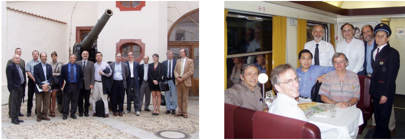
Figure 6. The participants of the first US–Czech seminar on astronomical X–ray optics, Prague, May 2007, with a remarkable train trip to ON Semiconductor company in Roznov pod Radhostem, where the participants were able to see the production of high–quality silicon wafers recently used in various X–ray optics applications.