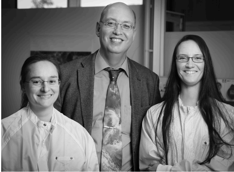
Figure 3. Research visit of a Czech PhD student at Aschaffenburg University during September/October 2016.