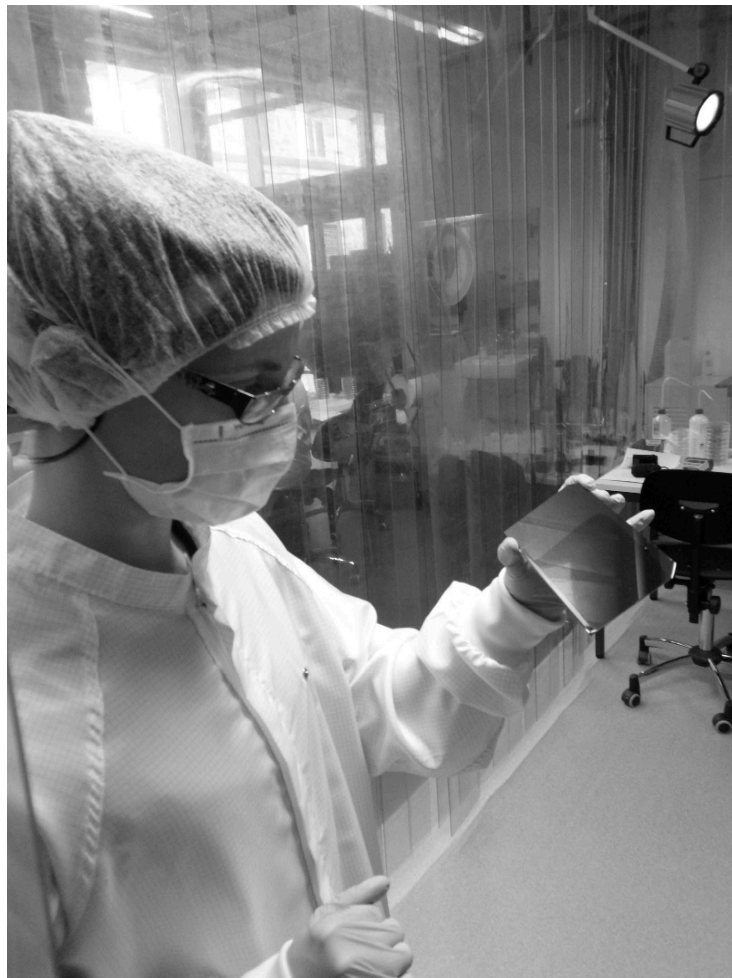
Figure 4. Prototype of an Ir/Cr-coated X-ray mirror.

mensions of 70 mm x 150 mm. During the joint coating development campaign also delamination of coated iridium layers has been observed. These effects are violating the requirement of long-term stability of the mirrors respectively their coatings. By applying an intermediate chromium adhesion layer a suitable mirror coating was achieved, resulting in a first mirror prototype [3] [4]. The mirror prototype is depicted in figure 4. The Ir/Cr-coated X-ray mirrors have been jointly developed within the JEUMICO project during the six-week research stay of the first Czech PhD student.