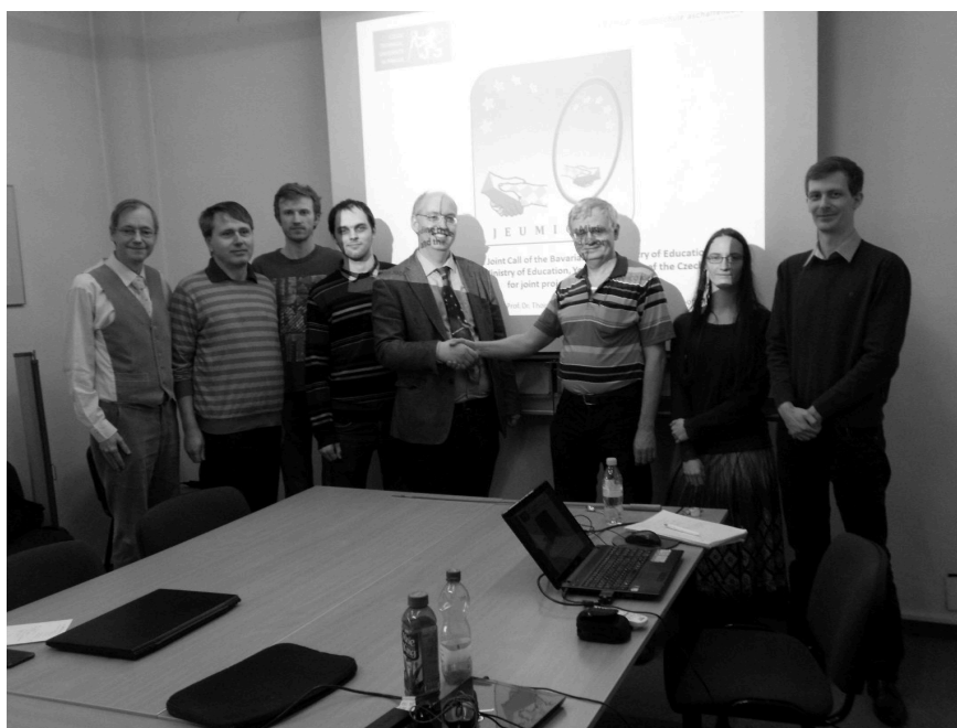
Figure 5. JEUMICO-team at the projects kick-off meeting in February 2016.

According to the intention of the joint call to enhance the cooperation between scientists from Bavaria and the Czech Republic, several project meetings have been organized either in Prague or in Aschaffenburg. An impression of the JEUMICO kick-off meeting is given in figure 5. In addition, several scientific workshops have been organized by the Czech group, which are co-financed by the granted JEUMICO project funding as foreseen in the initial project proposal. The INTEGRAL/BART workshops (IBWS) are a successful series of workshops