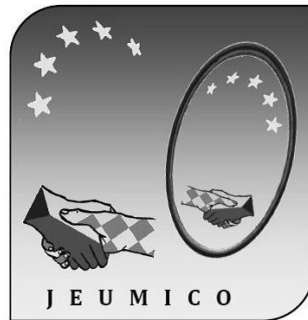
Figure 1. The logo of the JEUMICO-project.

acronym for Joint European Mirror Competence) to develop mirrors for X-ray telescopes. The aim of the project was the effective combination of experience, expertise and instrumentation of the Bavarian and the Czech partners in design, development, manufacturing, simulation and testing of innovative X-ray mirrors by the application of thin films. Especially astrophysical applications are considered in the proposed joint project. Within this project emphasis is given to the development of innovative thin and very lightweight X-ray mirrors for satellites with mirror thickness below 1 mm, which are formed into precise geometric shape and coated by thin iridium layers. Within this field the partners have complementary experience. The projects aim is to enhance the scientific cooperation between both research groups with the expected outcome of joint scientific publications and the organization of workshops and bilateral seminars on X-ray science. Intended long-lasting effects of the project are a regular exchange of scientists and students based on a living cooperation between both universities on an organizational level [2]. Finally the JEUMICO project was selected for funding for the years 2016 to 2017 and the project started with a kick-off meeting in Prague in February 2016. The logo of the JEUMICO-project is depicting the binational collaboration on mirror development (see figure 1).